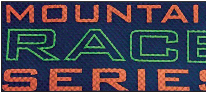
2-color solid screen imprint detail shown at 100%

We need to pre-approve your artwork as color registration requirements exist and vary per bag style. Some movement between colors will occur due to the printing method required for post-converted bags.